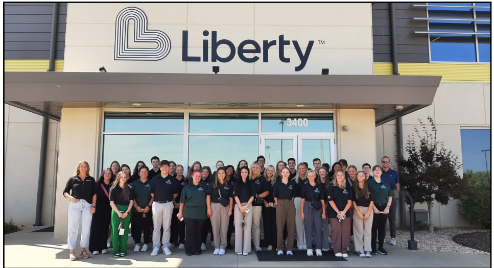
ABOVE: Afternoon MOSO CAPS Student Associates paused for a group photo during their tour of Liberty Utilities where they learned how the CAPS Corporate Sponsor implements safe operating procedures for its personnel, the public and area community.