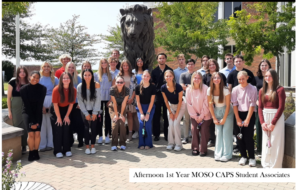
Afternoon 1st Year MOSO CAPS Student Associates