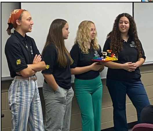
LEFT: Morning MOSO CAPS Student Associates present their completed LEGO build during the CAPSPrep project management and design thinking session.