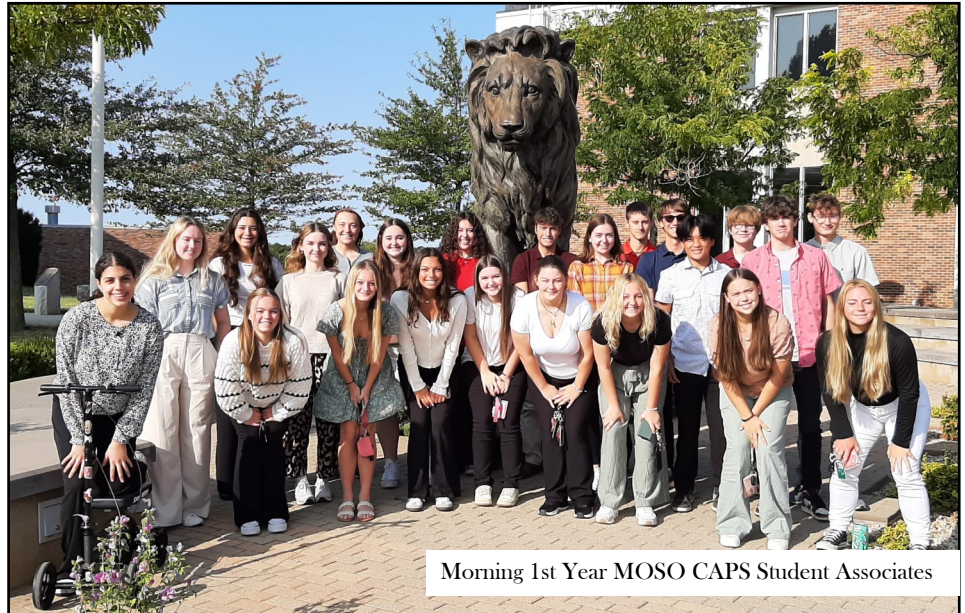
Morning 1st Year MOSO CAPS Student Associates